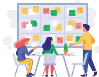
Projects / Assignments