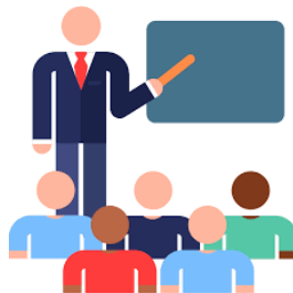
Flipped Class / Mentoring